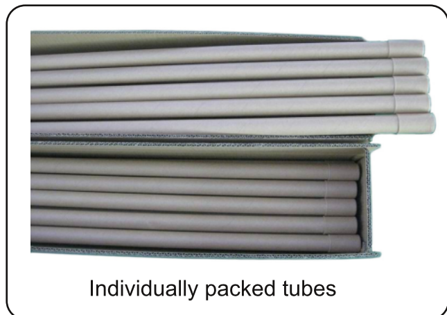
Individually packed tubes